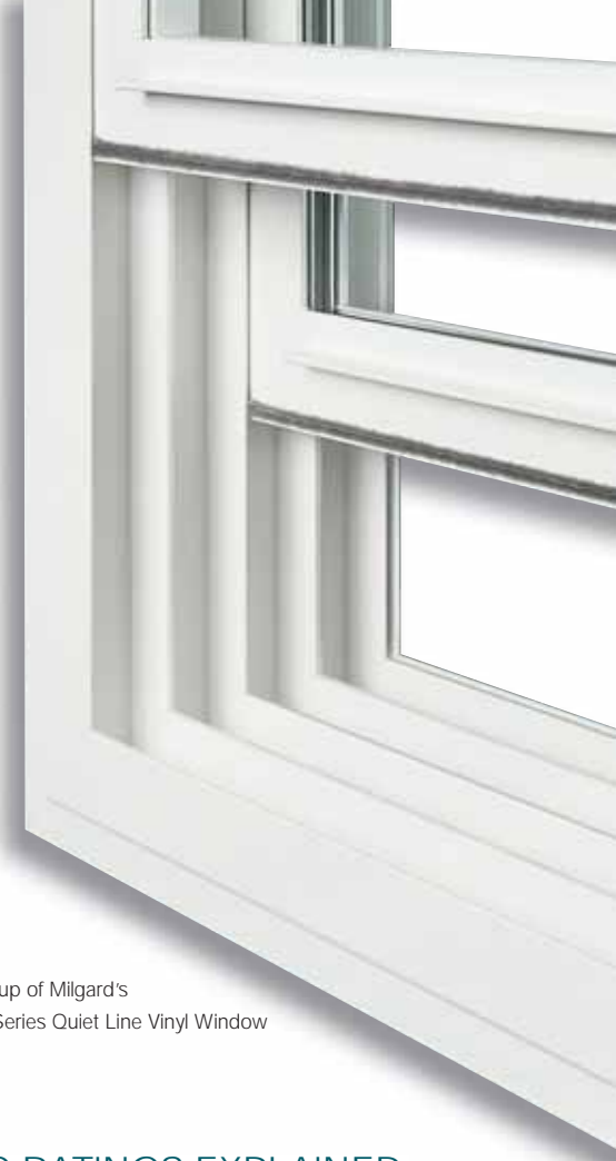
Close-up of Milgard's 7000 Series Quiet Line Vinyl Window

Note: STC windows may not be available in all operating styles. Please contact your Milgard Representative for information on product availability.